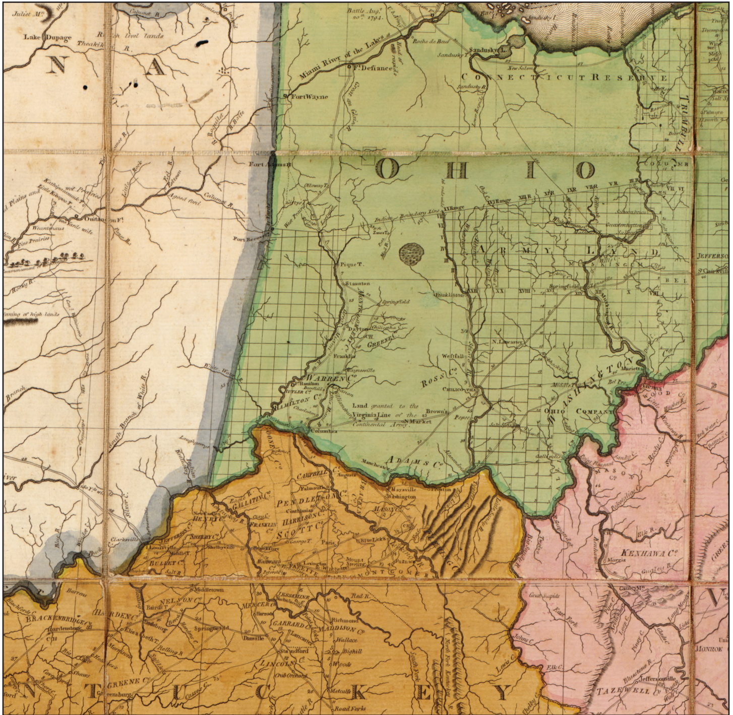
Figure 4b. Bradley, 1804. Comparison of part of Kentucky and the Old Northwest as depicted on the three maps.