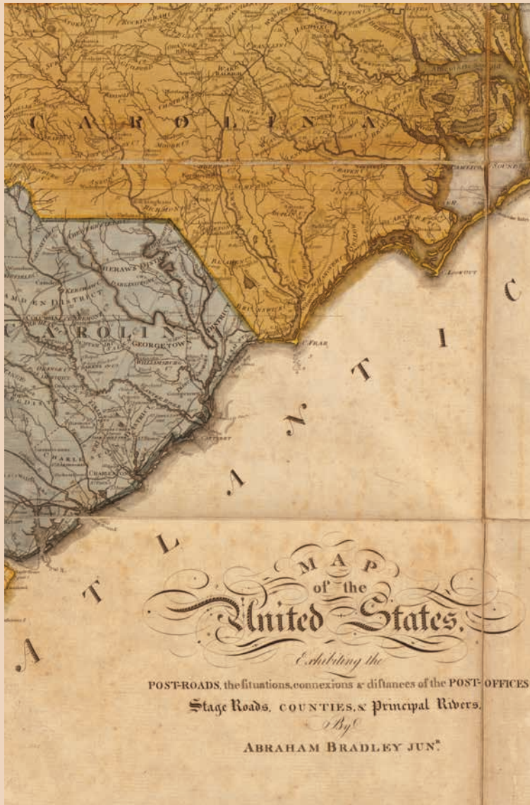
(Inset) Abraham Bradley, Map of the United States , (1804), 1st state.