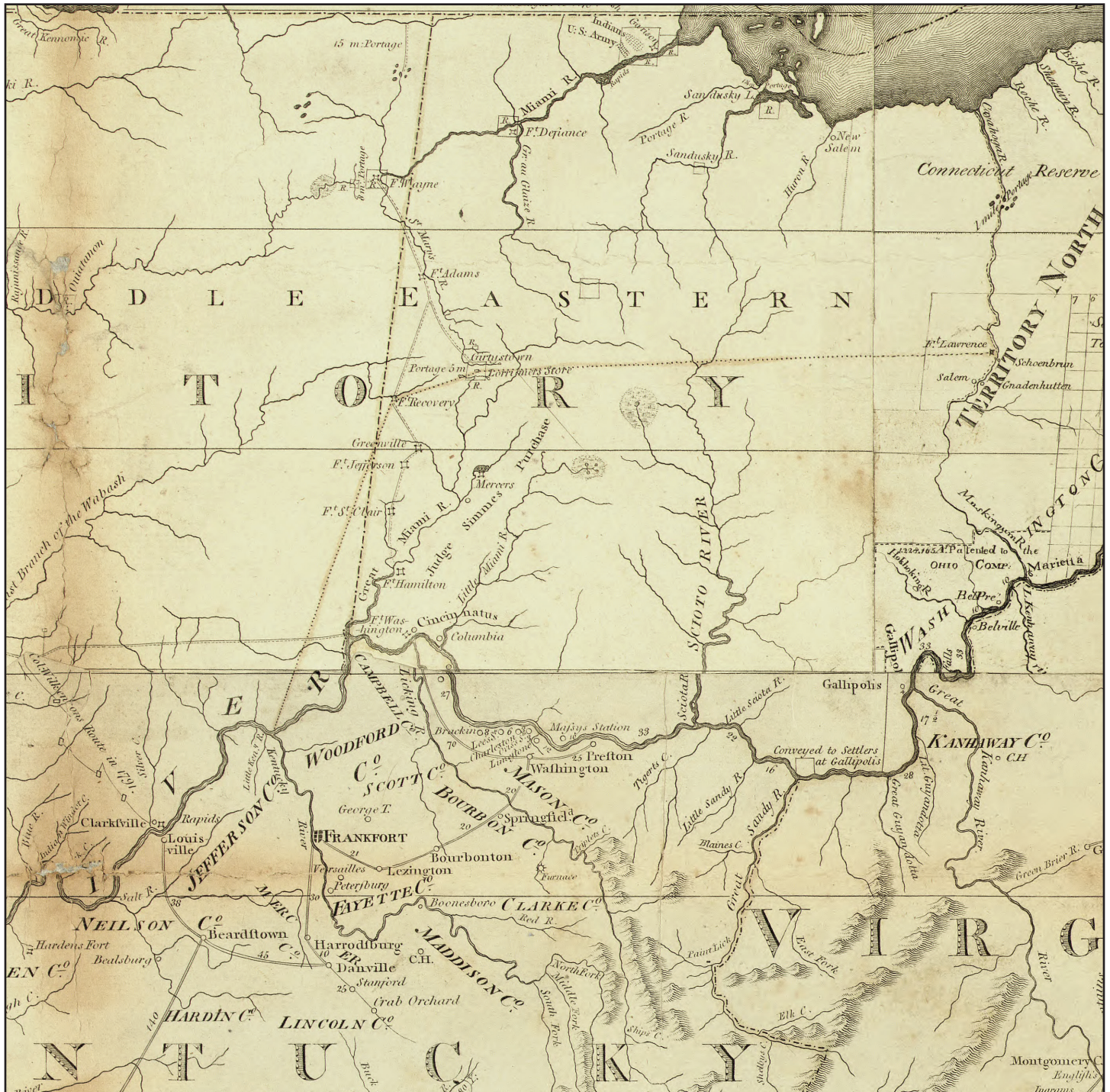
Figure 4a. Bradley, 1796. Comparison of part of Kentucky and the Old Northwest as depicted on the three maps.