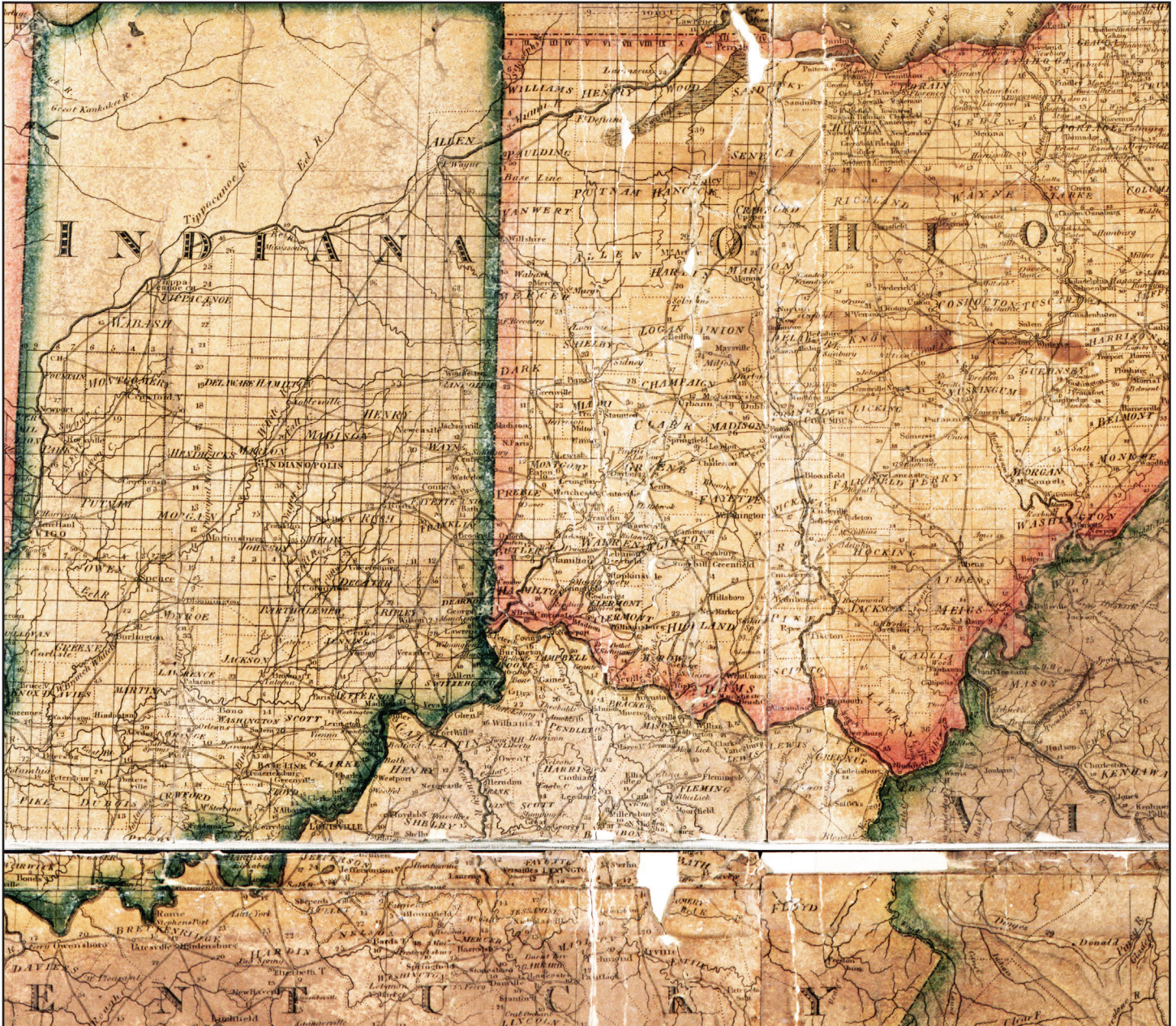
Figure 4c. Bradley, ca. 1825. Comparison of part of Kentucky and the Old Northwest as depicted on the three maps. [Editor's Note: Color and brightness enhanced for clarity using PhotoShop.]