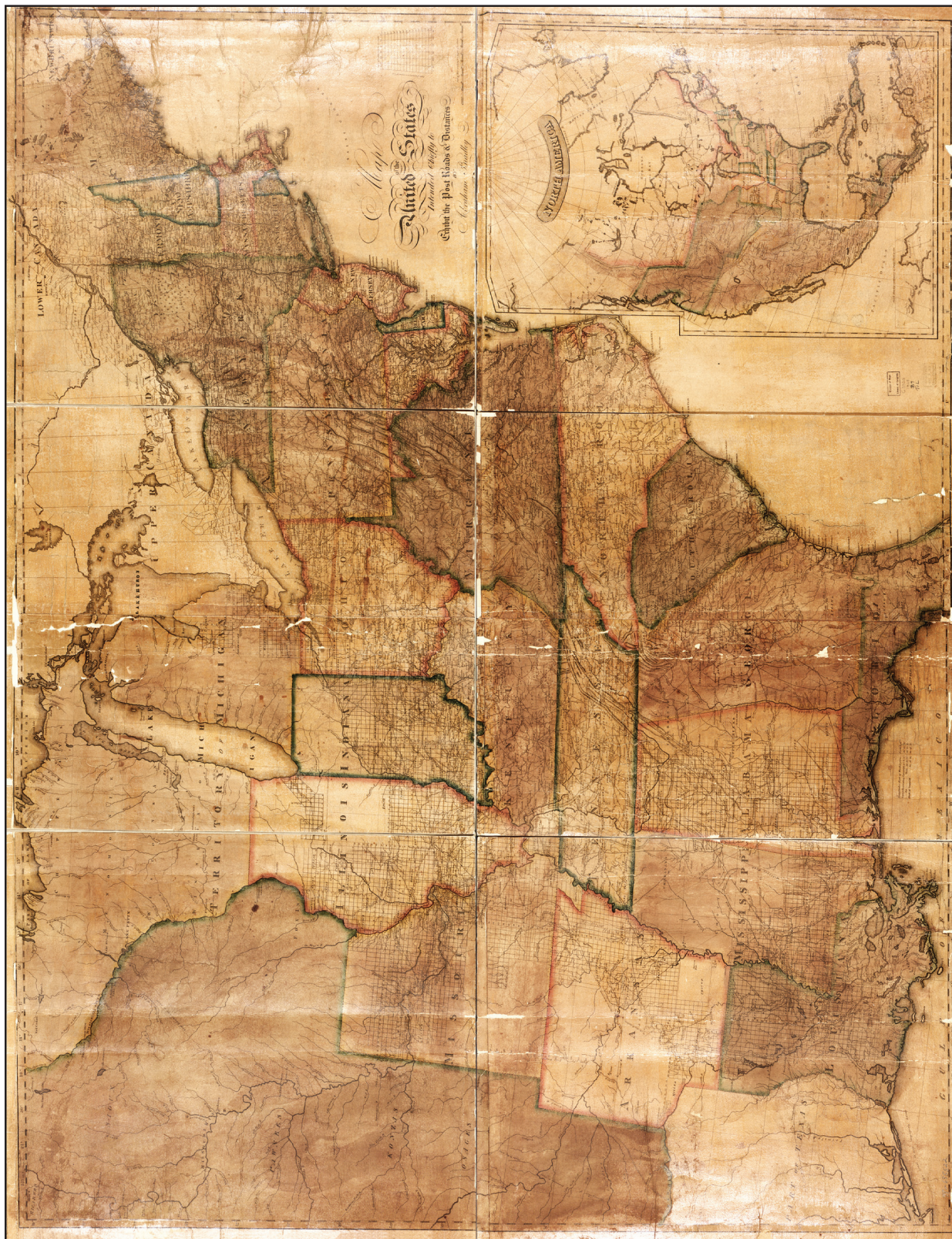
Figure 3. Abraham Bradley, Map of the United States , (ca. 1825), only known state. Viewable online at http://memory.loc.gov/cgi-bin/query/D?gmd:3:./temp/~ammem_NrF8: [Editor's Note: Color and brightness enhanced for clarity using Photoshop.]