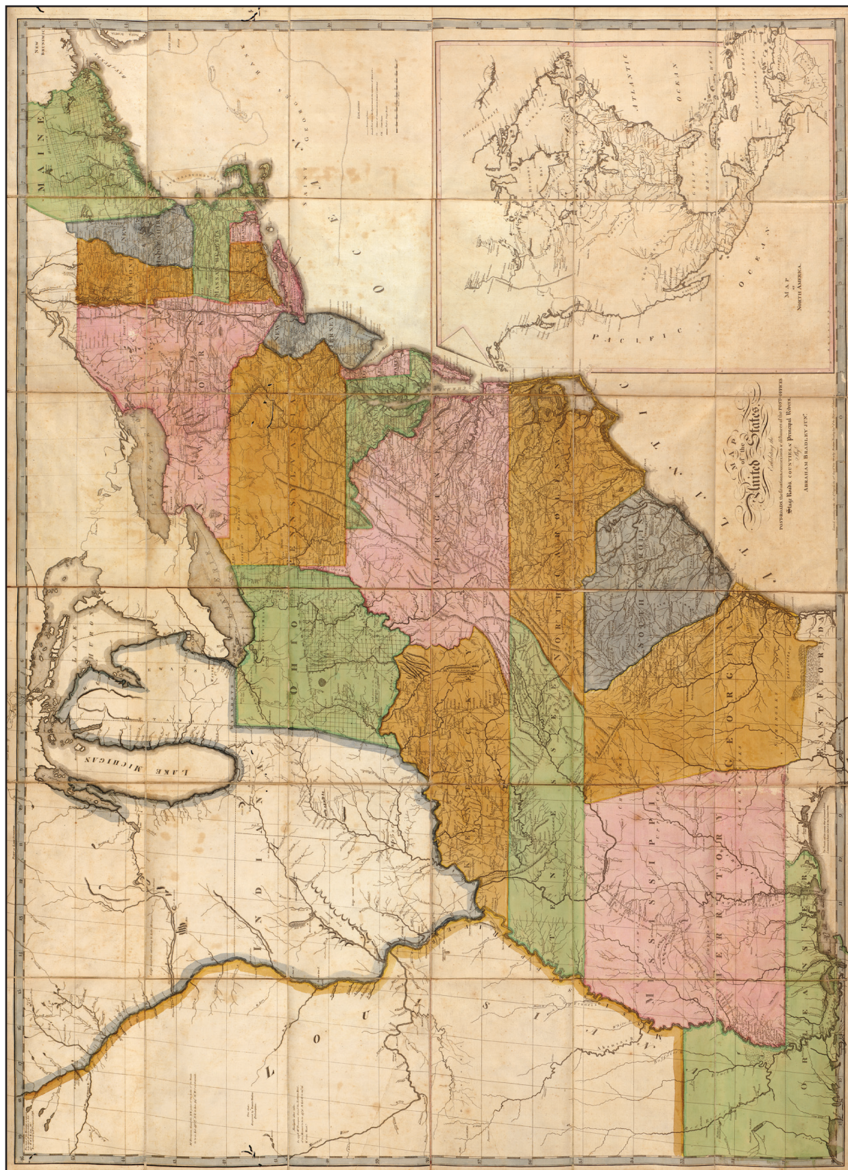
Figure 2. Abraham Bradley, Map of the United States , (1804), 1 st state. Courtesy of the Library of Congress, Geography and Map Division. Viewable online at http://memory.loc.gov/cgi-bin/query/D?gmd:2:./temp/~ammem_NrF8: