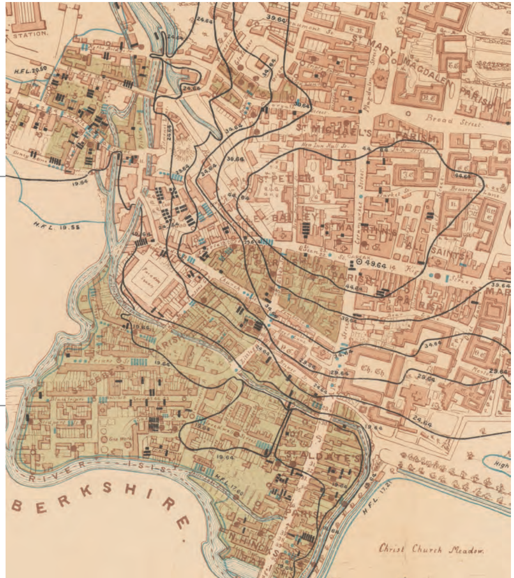
Figure 8. (Detail) Dr. Acland's map of Oxford, showing the contour lines and color scheme. "Map of Oxford to illustrate Dr. Acland's Report on cholera in Oxford in 1854, showing the localities in which cholera and choleraic diarrhoea occurred in 1854, and cholera in 1832 and 1849" in "Memoir on the cholera at Oxford, in the year 1854: with considerations suggested by the epidemic." London: J. Churchill; Oxford: J.H. and J. Parker, 1856.

map, marking incidences of high water. To Acland, these flood areas were places that bred toxic smells, not places where waterborne illnesses could more easily spread.