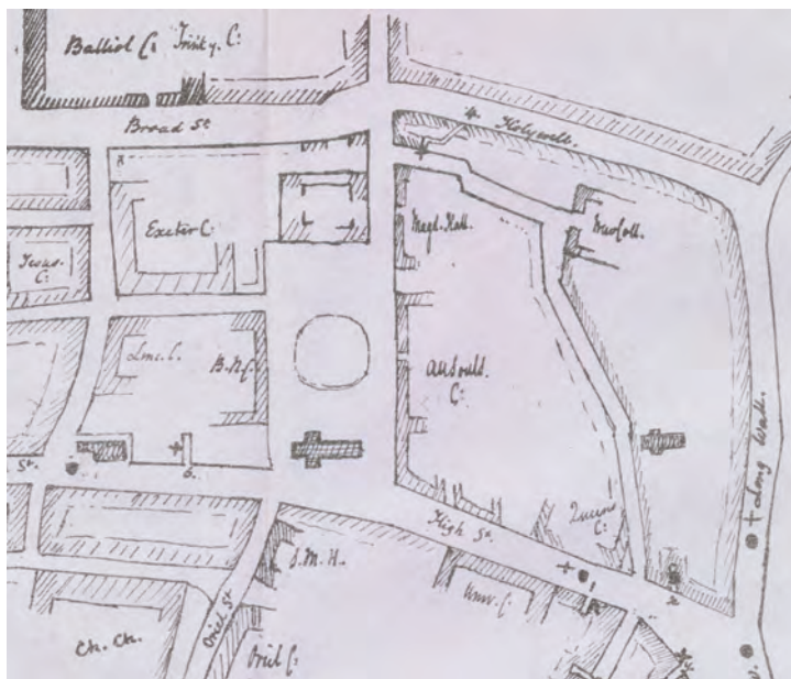
Figure 4. (Detail) Ormerod's Plan of Oxford, showing St. Helen's Passage (top middle) labelled with a small number "4." "Plan of Oxford shewing the parts visited by cholera and fever" in "On the sanitary condition of Oxford." Oxford: Printed by T. Combe, printer to the University, for the Ashmolean Society, 1848.