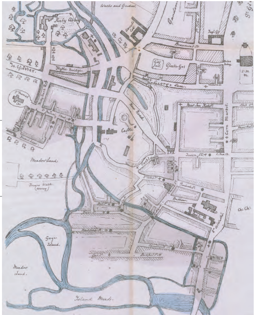
Figure 3. (Detail) Ormerod's Plan of Oxford. Centered on the St. Ebbes (middle) and St. Thomas (left) parishes. "Plan of Oxford shewing the parts visited by cholera and fever" in "On the sanitary condition of Oxford." Oxford: Printed by T. Combe, printer to the University, for the Ashmolean Society, 1848.