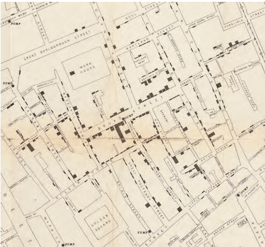
Figure 1. (Detail) John Snow’s map of the 1854 Broad Street outbreak, showing pump locations and cholera cases in “On the mode of communication of cholera.” London: John Churchill, 1855.

epidemiological data and its departure from the miasmatic theory of disease. The miasmatic theory was perhaps best summarized by English social reformer Edwin Chadwick: “All smell is, if it be intense, immediate acute disease; and eventually we may say that, by depressing the system and rendering it susceptible to the action of other causes, all smell is disease.” 1 During the cholera epidemics of mid-nineteenth-century England, doctors and laypeople alike felt threatened by “deleterious,” “tainted,” and “unwholesome” air. 2 They imagined disease “wafting through the globe” and insisted that the air was “oppressive from the smell of cholera.” 3 The surgeon Dr. Fred Symonds recalled