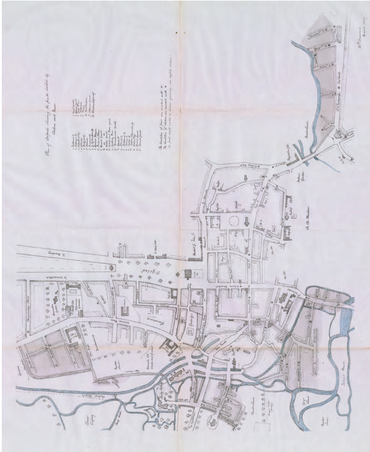
Figure 2. Ormerod’s “Plan of Oxford shewing the parts visited by cholera and fever” in “On the sanitary condition of Oxford.”

Oxford: Printed by T. Combe, printer to the University, for the Ashmolean Society, 1848.