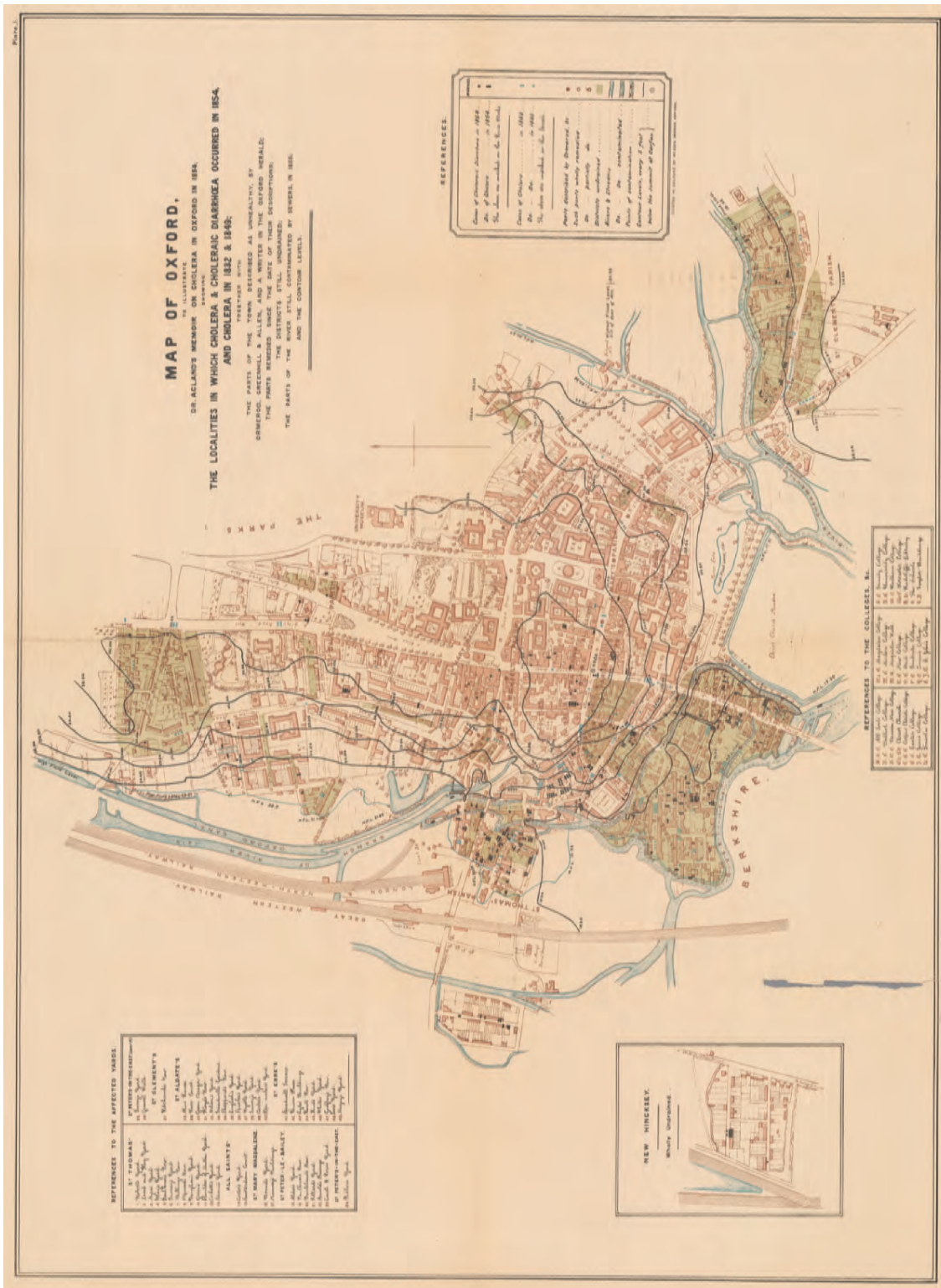
Figure 6. Dr. Acland’s “Map of Oxford to illustrate Dr. Acland’s report on cholera in Oxford in 1854, showing the localities in which cholera and choleraic diarrhoea occurred in 1854, and cholera in 1832 and 1849” in “Memoir on the cholera at Oxford, in the year 1854: with considerations suggested by the epidemic.” London: J. Churchill; Oxford: J.H. and J. Parker, 1856. Courtesy Stanford Libraries.

( https://exhibits.stanford.edu/blrcc/catalog/rt260gd2393 ).